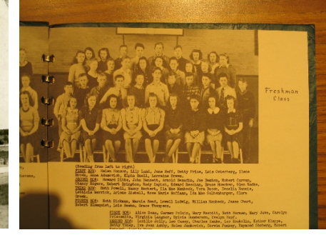
Eagle River Union High School